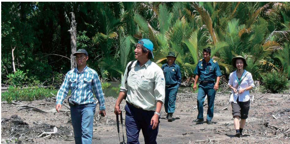
Figure 8 ISME and SFD officials visit project sites twice a year during each PSC Meeting.