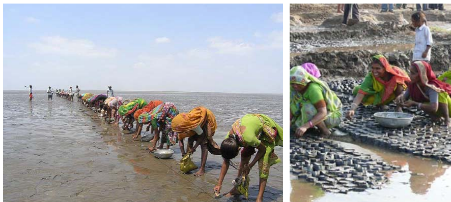
Figure 4 Line planting of Avicennia marina propagules in perfect synchrony on the barren mudflats (left) and raising seedlings in the nursery (right) by the womenfolk in colourful sari.