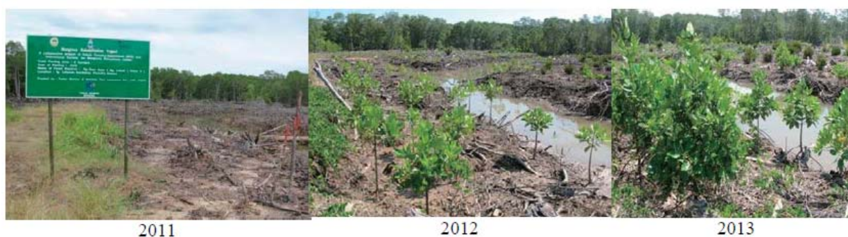
Figure 9 Growth of Rhizophora seedlings at Sg. Lalasun near Sandakan from 2011–2013.