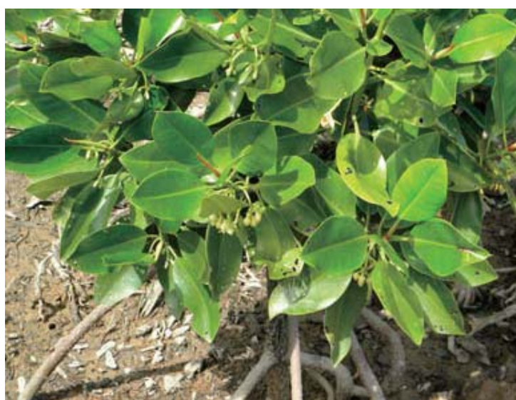
Figure 10 Some saplings of Rhizophora mucronata started flowering three years after planting.