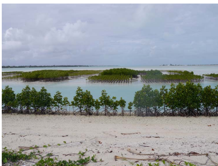
Figure 3 The amazing greening effort of the bare white coral sand flats in Kiribati by the school children and youth is showing positive results (background).