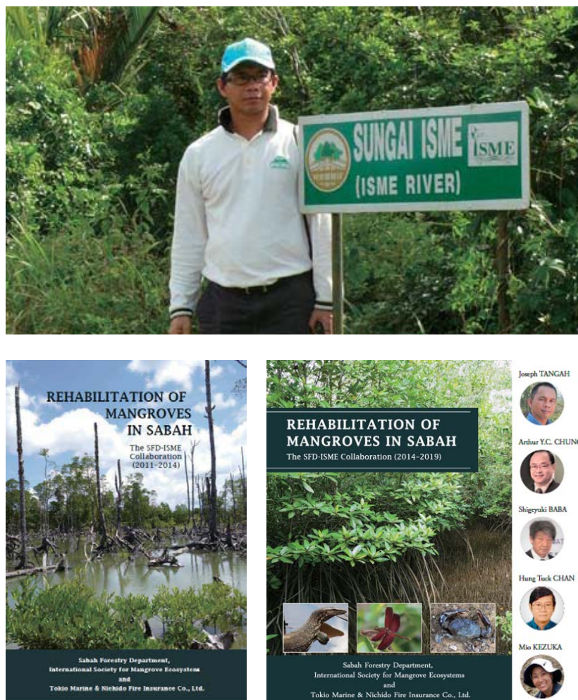
Figure 13 A river near Sandakan has been officially named after ISME (top), and books commemorating Phase I and Phase II of the project (bottom).