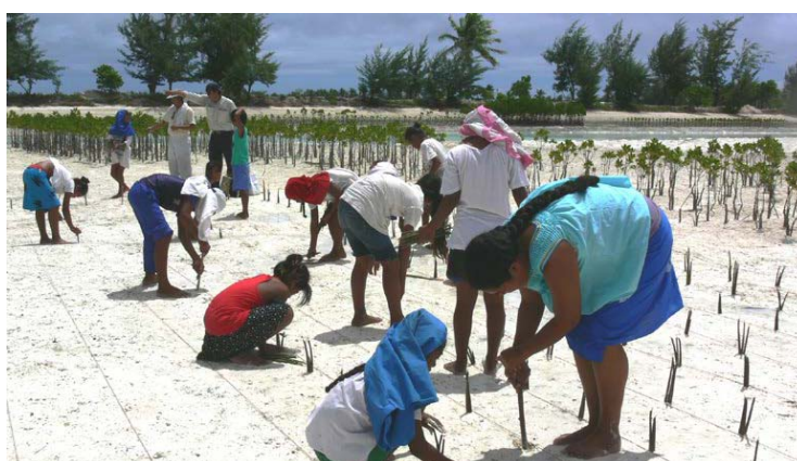
Figure 2 Teaching the school children in Kiribati the technique of group planting of Rhizophora stylosa propagules on the white coral sand under blistering heat.