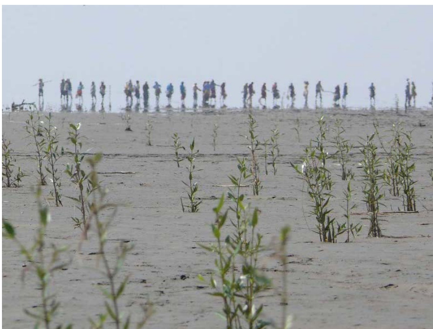
Figure 5 One-year-old seedlings of Avicennia marina .