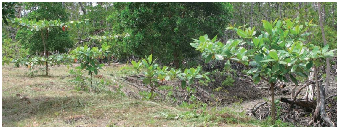
Figure 11 One-year-old Terminalia catappa seedlings planted on the bunds were more than two meters tall.