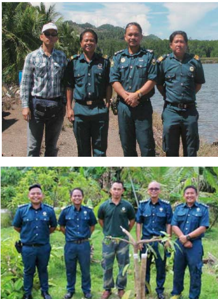
Figure 7 The mangrove task force of Phase I (top) and Phase II (bottom) of the project.

ISME and SFD officials visit the project sites twice a year during each meeting of the Project Steering Committee (Figure 8). The success of the project can be seen in Figures 9, 10 and 11. Wherever possible, other mangrove species such as Nypa fruticans , Avicennia alba , Hibiscus tiliaceus and Aglaia cucullata are also planted (Figure 12). As part of the project, a river near Sandakan has been officially named after ISME and the first phase of the project ended with a publication of a book (Figure 13).